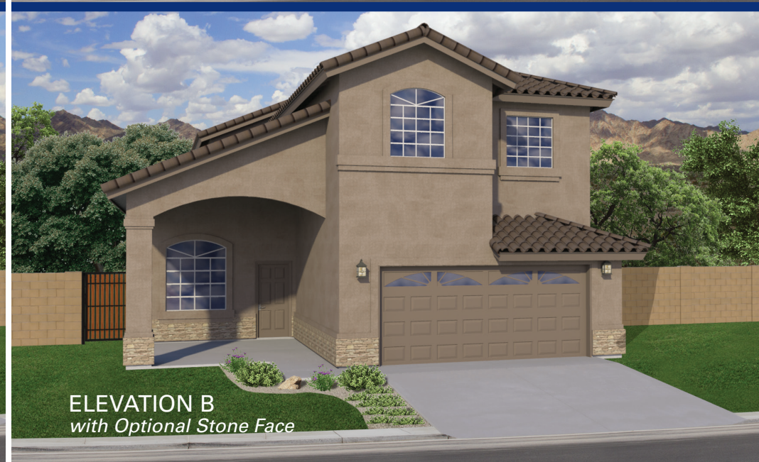
ELEVATION B with Optional Stone Face

PLAN 2465 4-5 Bedrooms • 3 Baths • 2 Car Garage • 2465 Sq.Ft.