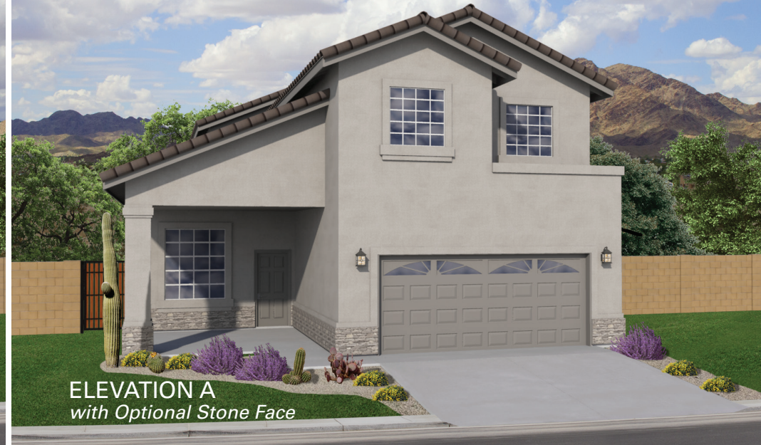
ELEVATION A with Optional Stone Face